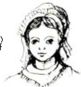
Marie Rose Julie Billiard

Julie Billiard was a country girl, born in the village of Cuvilly in the North of France. She had the happiness of being baptized the same day she was born, July 12, 1751.