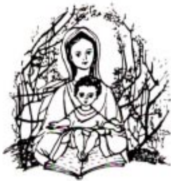
Notre Dame Our Lady

Mother of the poor, Mother of the afflicted, we pray to you for our suffering brothers and sisters.